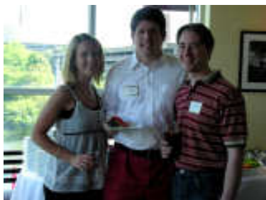
Class of 2007 Grads