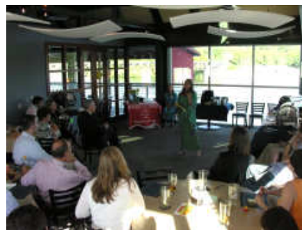
Graduates are sent off with the words of Atticus Finch