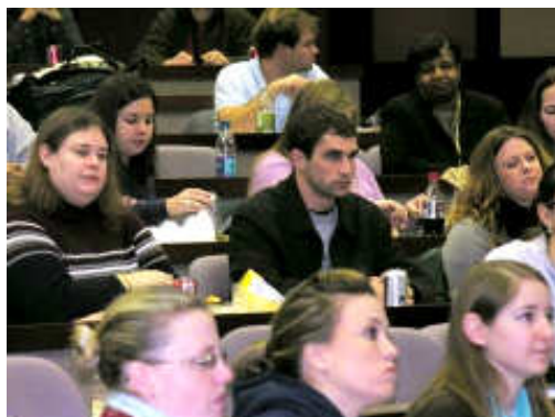
Students On Becton

“We must allow our voices and bodies to be the instruments and our arguments to be the symphonies.”