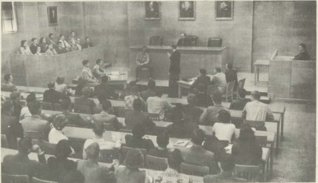
Facilities and accommodations of the Moot Courtroom in the new College of Law Building are proving a real asset to law students learning practical court procedure. The modern auditorium is one of the busiest on the U-T campus.