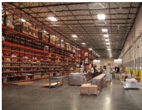
Active's Mira Loma distribution center

On Monday, March 23, 2009 Active filed for chapter 11 16 protection in the United States Bankruptcy Court, Central District, in Riverside, California. 17 Active retained the legal services of the Newport Beach, California law firm of Winthrop Couchot, P.C. 18 and the financial advisory services of