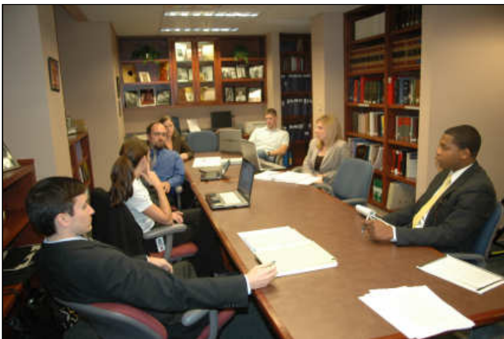
Students in the Externship Programs discuss their cases.

“As a member of the legal profession, we can make a huge difference in these children's lives.”