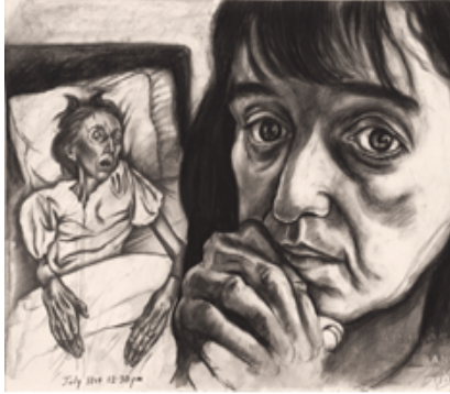
One of Sue Coe's portraits of a woman in a Texas prison.