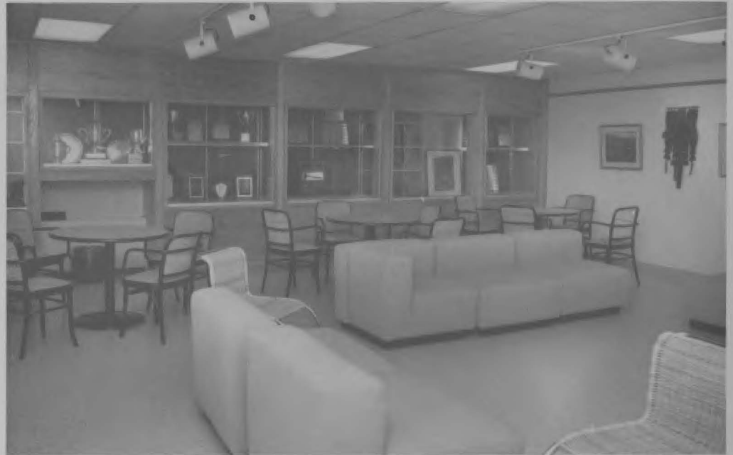
Trophies in the case at left were won by UT's Moot Court Team in the 1976 National Competition.

We cordially invite you to stop by to see this new feature of the College.