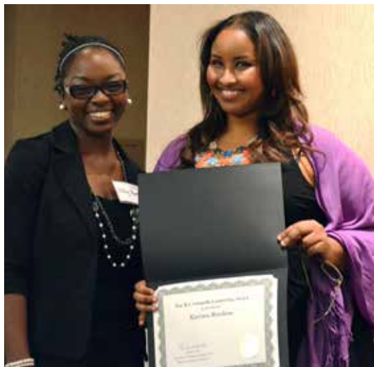
Judge Cheri Beasley of the North Carolina Supreme Court (top right, third from left) gave the keynote address at this year's Blackshear Gala. Several awards were presented to students throughout the night for their contributions to diversity and excellence.