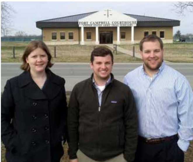
Students volunteered with a number of organizations during Alternative Spring Break, performing services like collecting water samples in the Appalachian coalfields and assisting in the Fort Campbell JAG office.