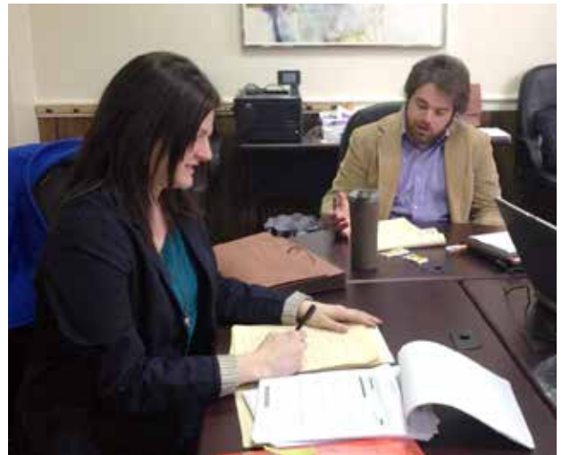
At right: UT Law students partnered with Belmont, Memphis, Vanderbilt, and Duncan law schools to complete U-Visa applications for undocumented individuals fleeing domestic or war violence.