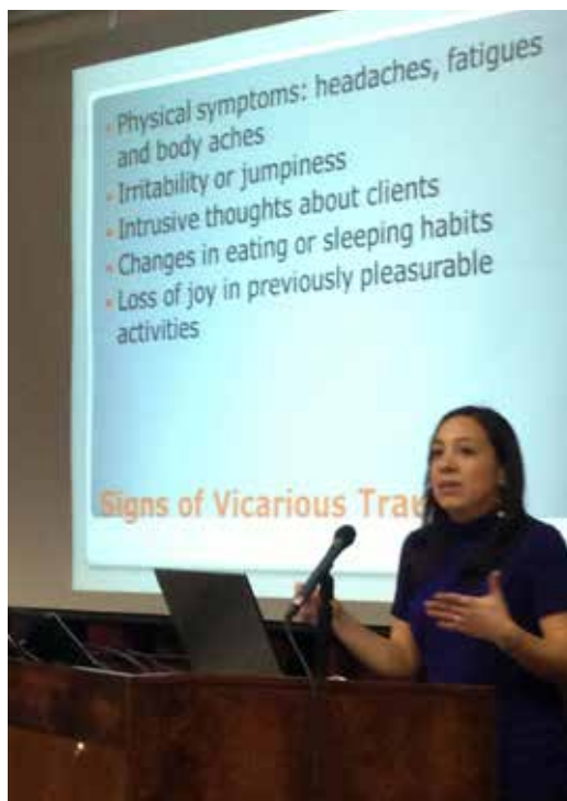
Above: Students underwent a training program before beginning work on the immigration project. They were counseled on how to handle the stresses of working with clients who are fleeing violence.

phus Cecil C. Humphrey's School of Law, Vanderbilt Law School, and the Duncan School of Law to see the process through to completion during the month of March.