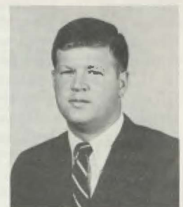
C. SAXBY CHAMBLISS

C. SAXBY CHAMBLISS is a native of Darien, Georgia. He is 24 years old and married. He received the Bachelor of Business Administration degree from the University of Georgia where he was a member of Sigma Chi Fraternity. He has been the President and Treasurer of the Student Bar Association. He has served on the staff of the U-T Lawyer and is a member of the law library staff. He is a member of Phi Delta Phi legal fraternity. He will receive his J.D. degree in December, 1968.