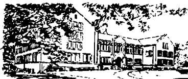
GEORGE C. TAYLOR LAW CENTER The University of Tennessee College of Law

A model of the new and improved GCT is on display in the Legal Clinic Lobby.